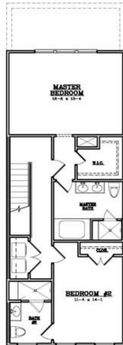
3 3rd. LEVEL FLOOR PLAN AA.8 SCALE 1/4" = 1'-0" HAVEN