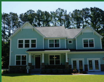
"The Stonefield" At Ashley Forest $337,095

4 BR/3 BA Open Floor Plan Tons of Upgrades! Located on Wooded Homesite 61. .68 Acre Lot! Coming Soon