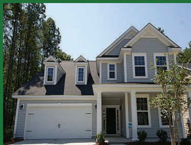
"The Drayton" At Ashley Forest $341,825

4 BR/3 BA Open Floor Plan Tons of Upgrades! Located on Wooded Homesite 61. .68 Acre Lot! Coming Soon