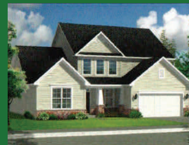
"The Lexington" At Ashley Forest $355,717

A Must See! 3 Car Garage 4 BR/2.5BA Cul-de-Sac Lot! Located on Homesite 5. Under Construction